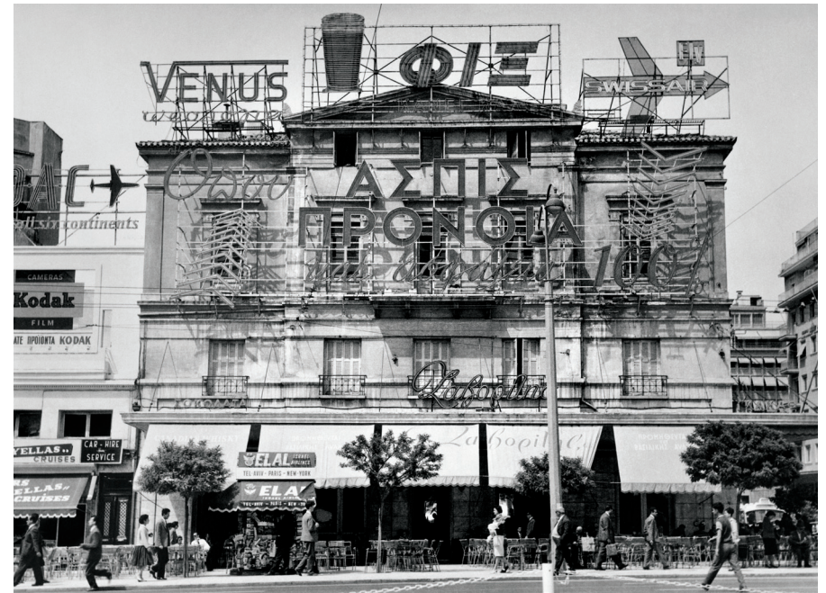
Artist Unknown Zavoritis Patisserie in Syntagma Square (now demolished), Athens, early 1960s Reproduction of 12 x 17 cm gelatin silver print EPMAS Collection / Photographic Archives